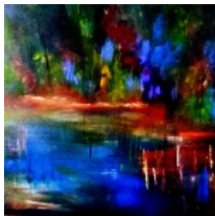
A Study in Light