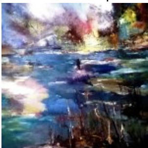
Clouds on the Water