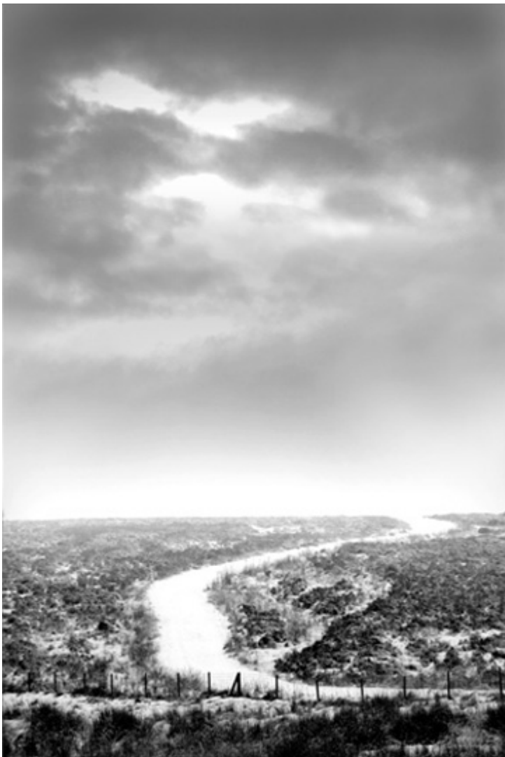
Farm Track up Cuilcagh

Enniskillen Castle recently had an exhibition of his work, a catalogue of which can be seen at http://michaelbrownlandscapes.org , and he has also exhibited in Dublin, Belfast, and the West of Ireland.