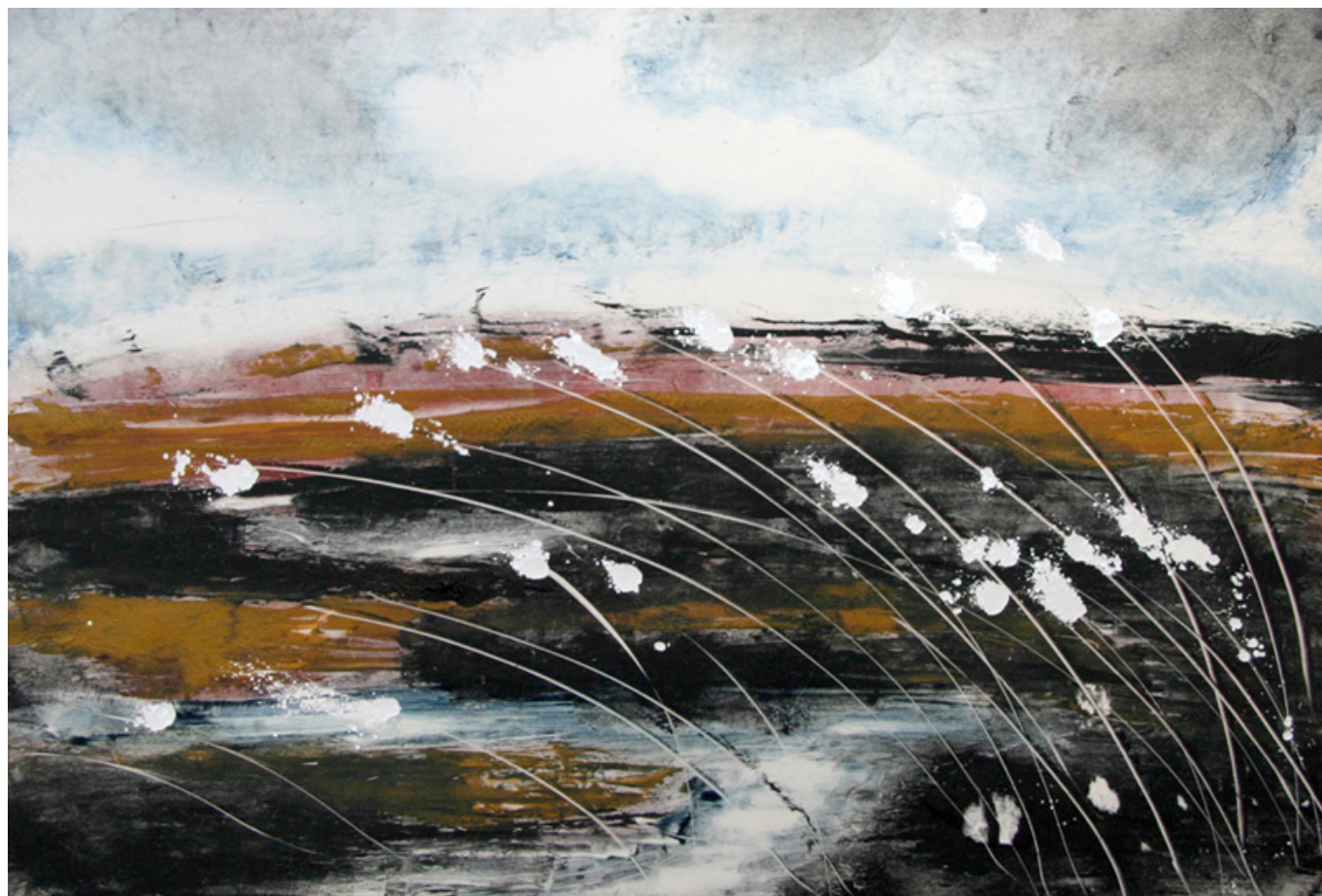
Bog Cotton III

In Monotype he lays ink freehand on a zinc plate, creating expanses of peatland in black and umber, the white stalks of bog cotton picked out in negative by the flick of a palette knife – their frothy blooms, scattering of French chalk to absorb the ink. Only one print can be pulled from each inking – hence the name monotype – and you can never entirely control the effects. Sometimes you are rewarded by happy accidents, as in the subtle shading of Cuilcagh in Mist .